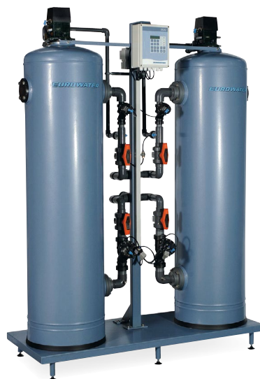
Softening plant type SMH 602.