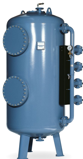
Pressure filter plant type TFB 14.

Water treatment plant producing 3 \times 25 \text{ m}^3 / \text{h} ultrapure water for a chemical company. The installation consists of three individual frame-mounted lines, each with reverse osmosis with a water saving plus-stage, followed by an EDI system.