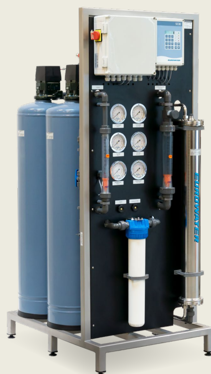
Frame-mounted CU:RO compact unit; a complete reverse osmosis system with integral pretreatment on a single stainless steel frame – ready for use.

Our long experience and modular designed products guarantee high reliability of the plants, short delivery time, and competitive prices.